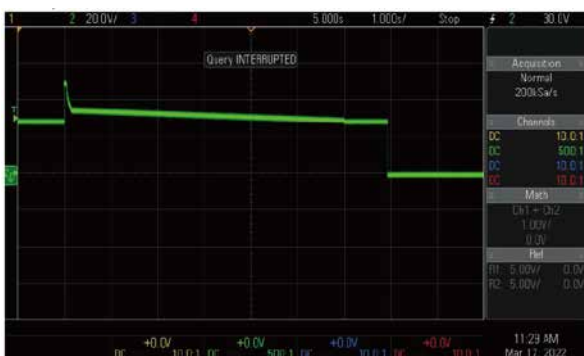
LDC302 28V abnormal voltage transients (overvoltage)